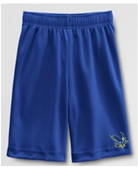
Cobalt Shorts with logo (for PE only)