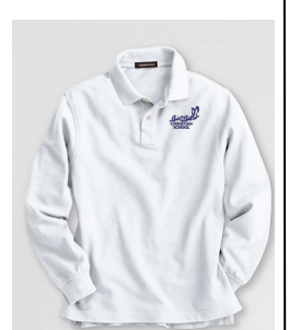
White Polo with logo (Required for Chapel Day)