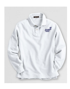
White Polo with logo (Required for Chapel Day)