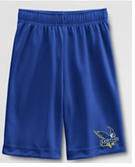
Cobalt Shorts with logo (for PE only)