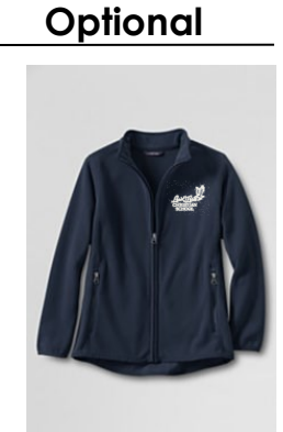
Navy Fleece Coat with logo (optional)