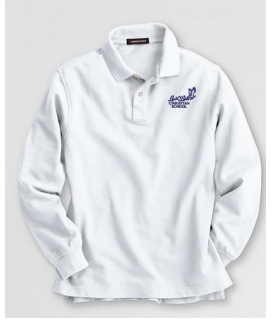
Hunter Green or White Polo with logo