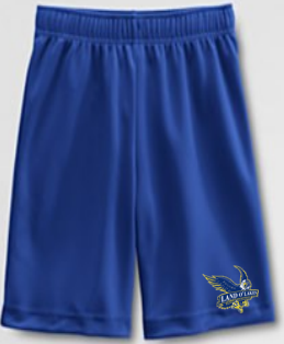
Cobalt Shorts with logo (for PE only)