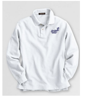
Hunter Green or White Polo with logo