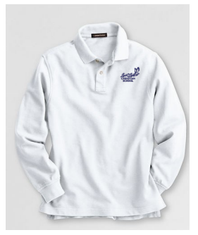
Hunter Green or *White Polo with logo

(*White Polo with logo is required for Chapel Day)