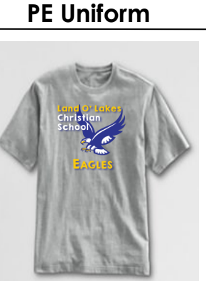
Gray T-shirt with logo (for PE only)