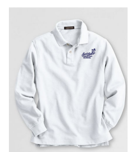
White Polo with logo