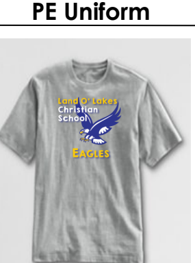
Gray T-shirt with logo (for PE only)