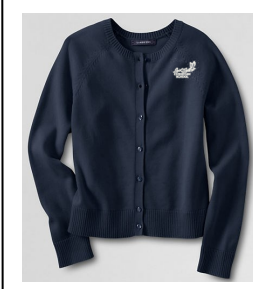
Navy Cardigan with logo (optional)