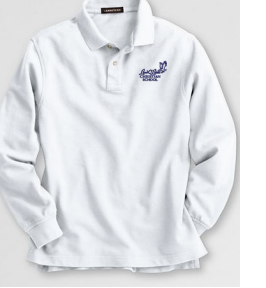
Navy Polo or White Polo with logo