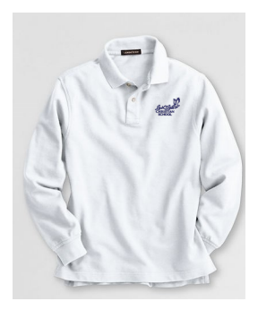
Navy or *White Polo with logo (*White Polo with logo is required for Chapel Day)