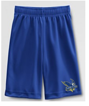
Cobalt Shorts with logo (for PE only)