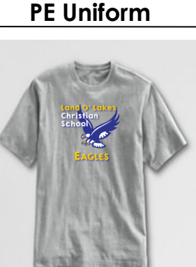
Gray T-shirt with logo (for PE only)